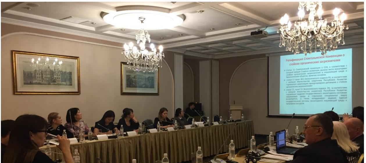
Inception Workshop participants listening to the opening speech