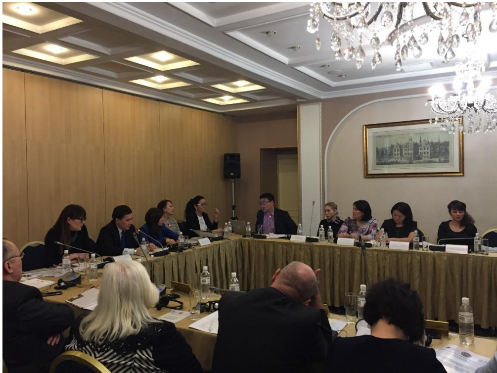
Suggestions and recommendations session